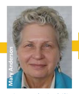
Aging and Disability Services