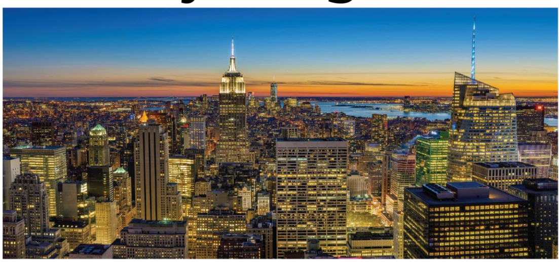
OUR NEW YORK CITY EXPERIENCE