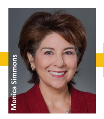
City Clerk Legislative Operations