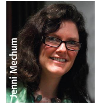
ADA/ Title VI Civil Rights Program Administrator

Loops recommended for all city remodels and new buildings where feasible .