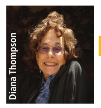
HLAA Chapter Leader Network on Aging